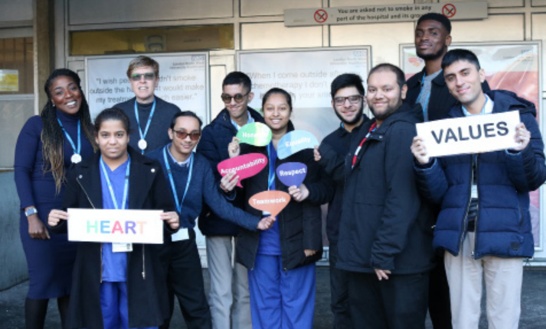
Current Project SEARCH Interns for 2019-2020 with their coaches at Northwick Park Hospital.