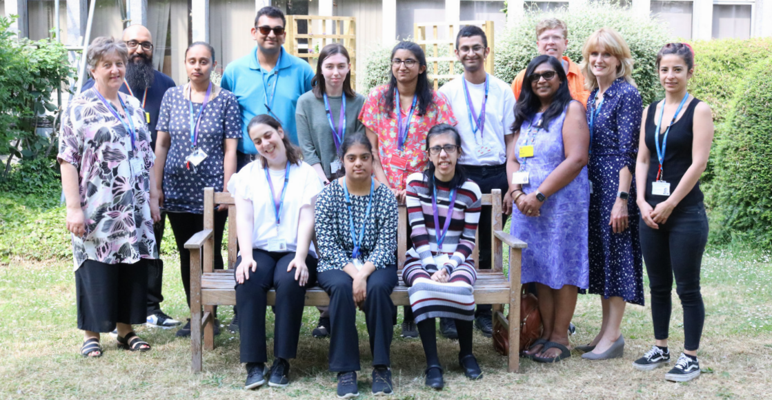
DFN Project SEARCH Interns from the 2022-2023 intake with their tutor and job coaches at Northwick Park Hospital.